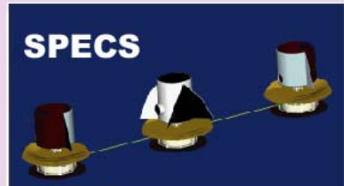
SPECS Submillimeter Probe of the Evolution of Cosmic Structure