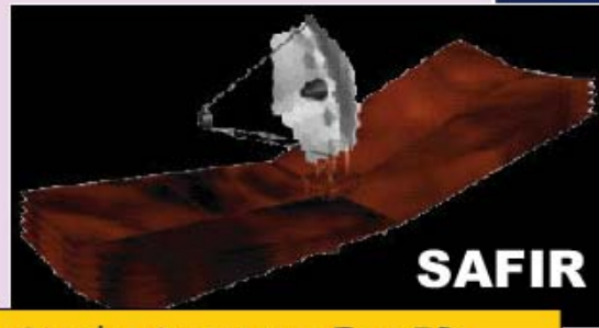
SAFIR Single Aperture Far-IR Telescope